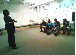
Graduation Coach of Communities In Schools share resources and their commitment to Knightdale HS students

To provide equitable education resources for students who may not have access. We will prepare all students to use critical thinking, and, analytical skills to achieve academic success. We are dedicated to closing the achievement gap. It is our intent for students to graduate on time, prepared for college or the work force, and helping others after their achieved success.